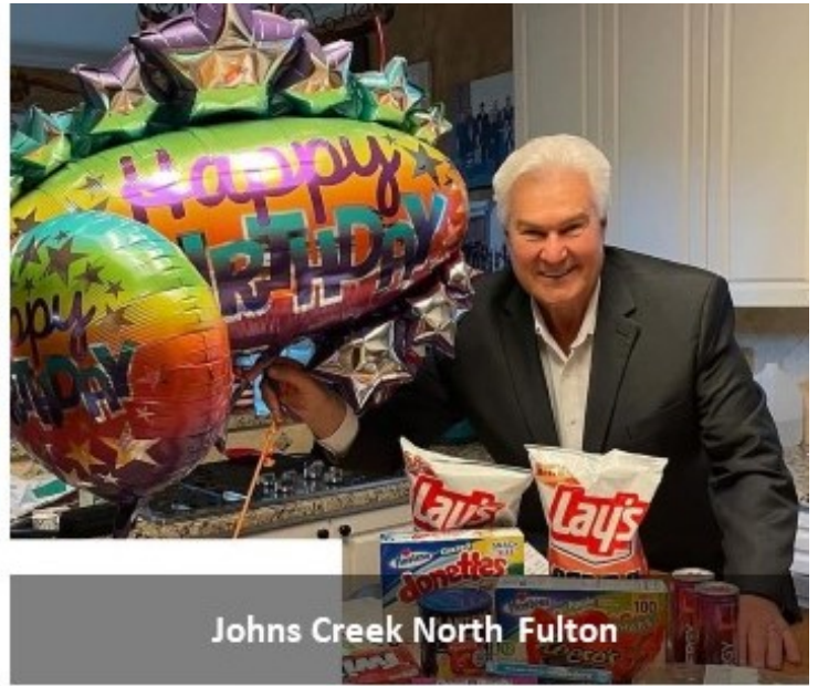
Johns Creek North Fulton