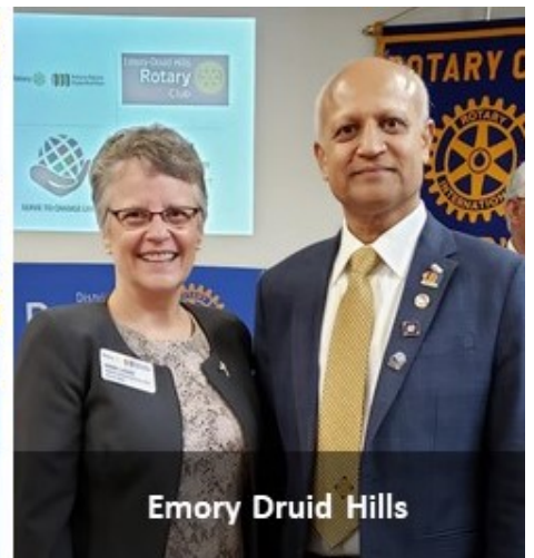
Emory Druid Hills