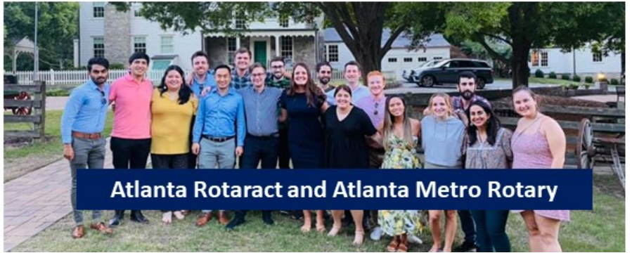
Atlanta Rotaract and Atlanta Metro Rotary