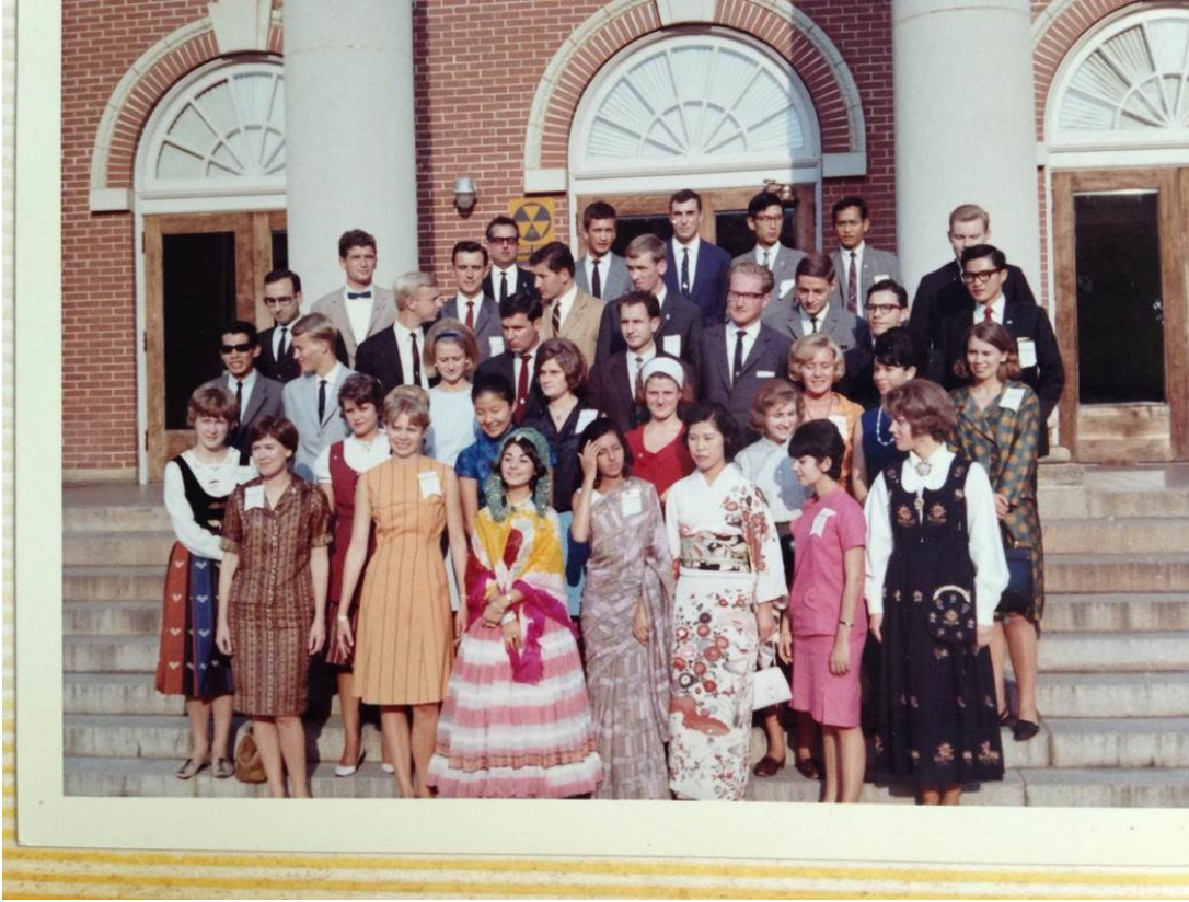
Vintage throwback photo: GRSP Class of 1965-66 at the GRSP Conclave in 1965