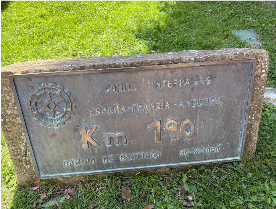
Local Rotary club in Santo Domingo de la Calzada marking the 190km point on the Camino