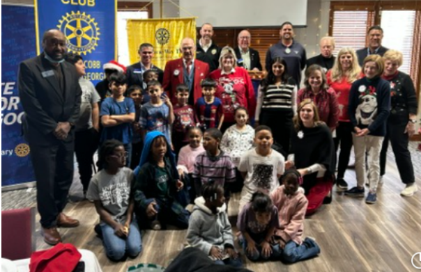
South Cobb Rotary Christmas