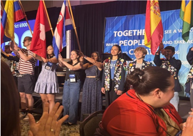
GRSP carries on tradition of presenting their flags