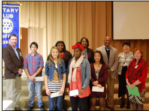
Destination Graduation 2018!