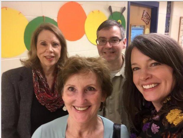
Morning Crew Selfie

We need one more volunteer from 8-9 a.m.!