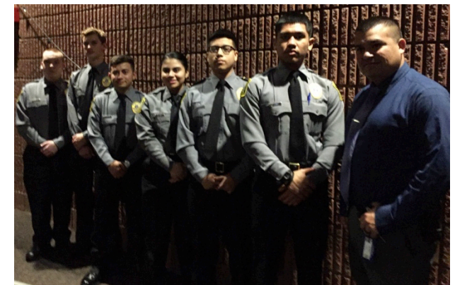
Right Bottom: Brookhaven and Sandy Springs Police Explorers