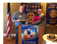
This photo speaks for itself