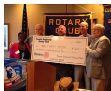
Presentation to AFM