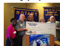
Presentation to PROMISE PLACE