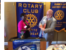
Gov Raymond signs book for the library