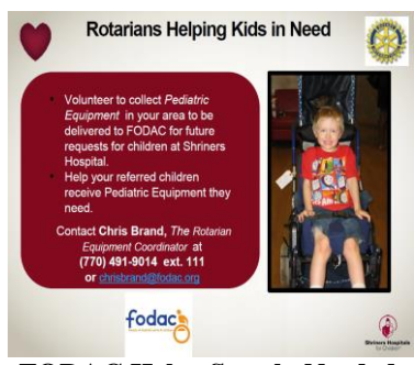
FODAC Helps Supply Needed Pediatric Equipment