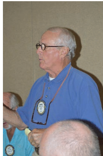
Johnny Fulmer stated Cobb Diaper Day would be September 30 th and asked members to bring diapers to the September 16 th and 30 th club meetings.