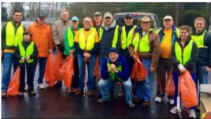
The Rotary Clubs of East Cobb (left) and Alpharetta (below) both had good turn-outs for Adopt-A-Mile events.

By increasing the public's understanding of Rotary we're strengthening our ability to make an impact in our community and make a positive contribution to our growth as a Rotary Club.