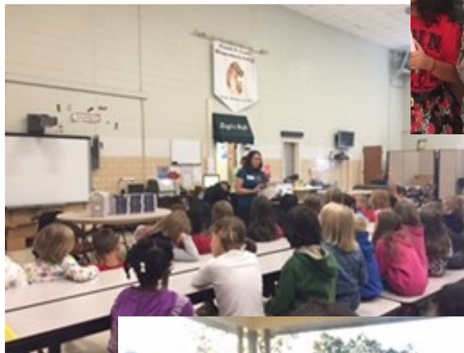
Above and left: Fort Benning students. Below: The team who delivered dictionaries at Easter Seals West Georgia