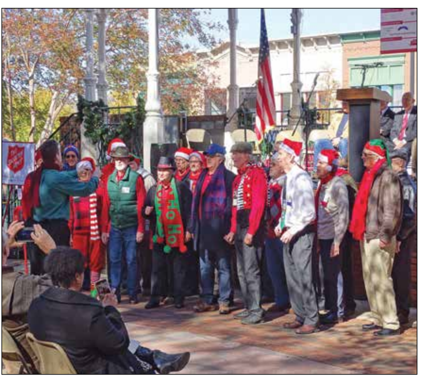
Entertainment was provided by the "Big Chicken" Chorus