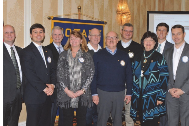
The 2019-20 Board of Directors for the Rotary Club of Marietta Metro were elected.