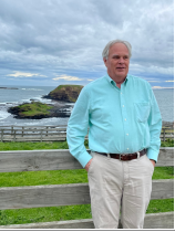
Thank You to a Donor - Thank You - All COVID Support and to Thank You!

The Rotary Foundation is grateful for the generous support of our donors. Your contributions help us provide essential services and support for our members and the community. Thank you for your continued support and partnership.