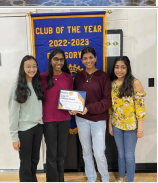
2023 District Club of the Year

Congratulations to the winning club for their exceptional leadership and service. Their dedication has made a significant impact in the community.