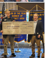
2023 Club Spirit Award for Leadership

Join us for a public speaking event featuring expert speakers and a Q&A session. This is a great opportunity to improve your communication skills.