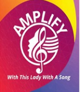
Area 11 Amplify Rotary at 2023 District Conference - Registration Open

The Rotary Foundation is seeking proposals for community and collaborative grants to support projects that align with our strategic goals. Applications are due by [date]. For more information, visit rotary.org/grants .