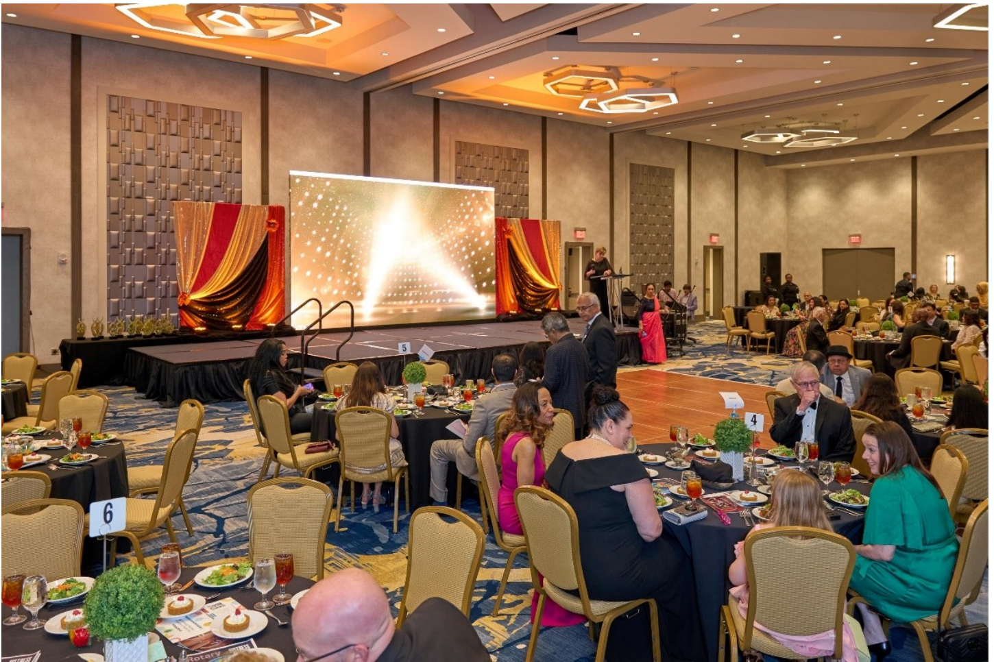
Posted by Syd Padala May 5, 2024