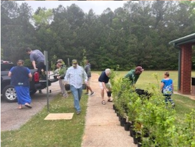
Posted by Amy Lemelin May 5, 2024