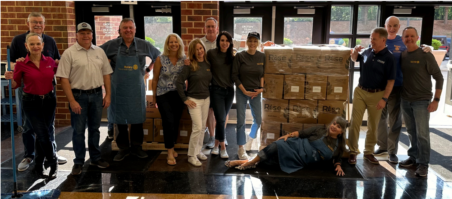
Posted by Lisa Gelber May 5, 2024