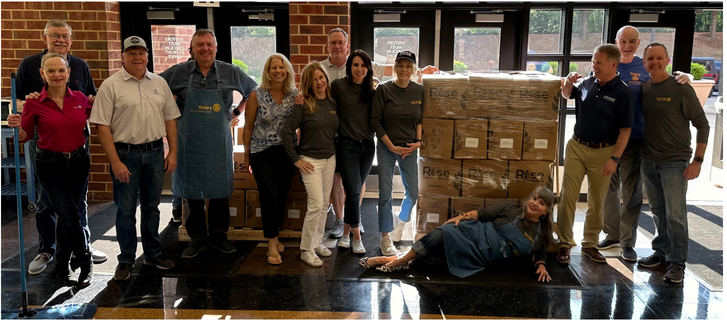
Posted by Lisa Gelber May 5, 2024