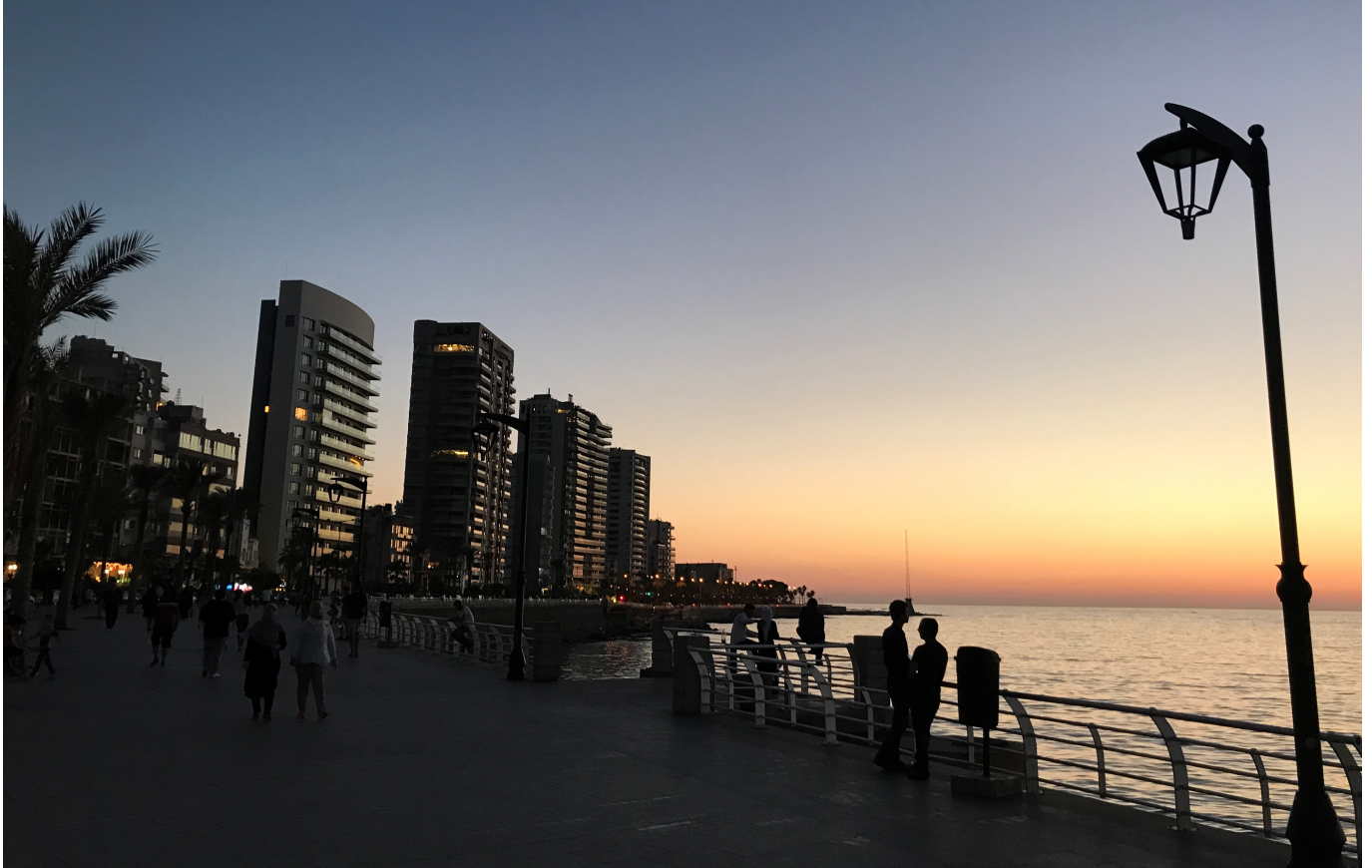
Posted by Jackie Cuthbert July 7, 2018