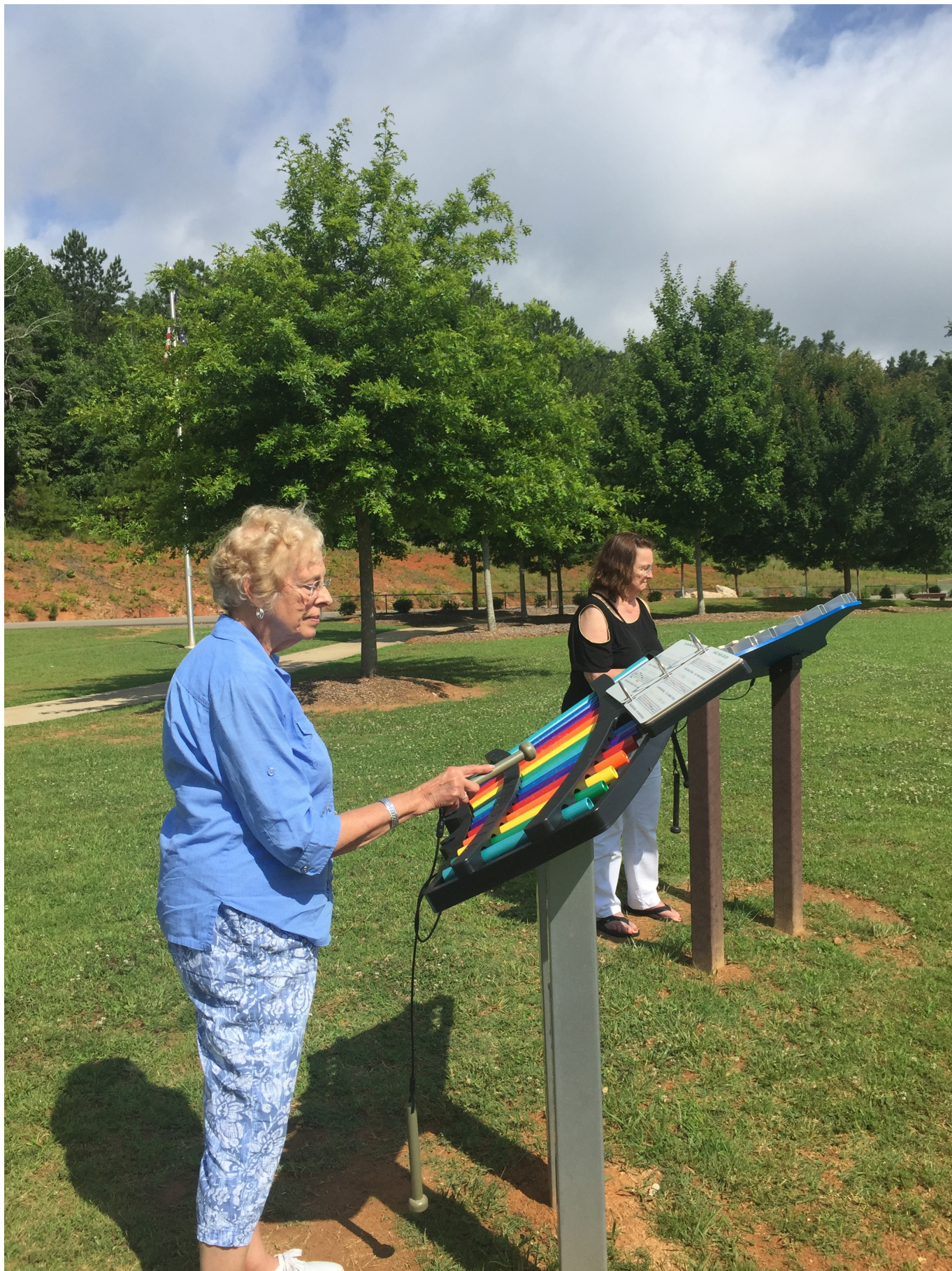
Posted by Dale Covington December 31, 1969 7:00pm