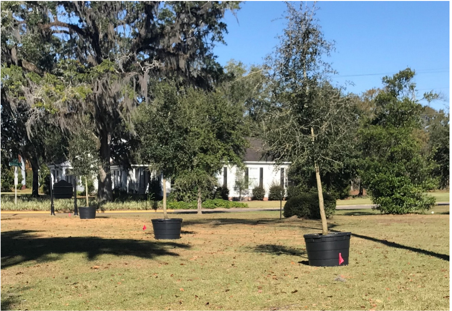
Posted by Carol Jones January 28, 2021