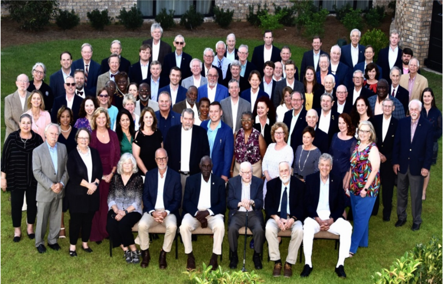
The Rotary Club of Thomasville was officially launched in the first week of May 1921. Exactly 100 years