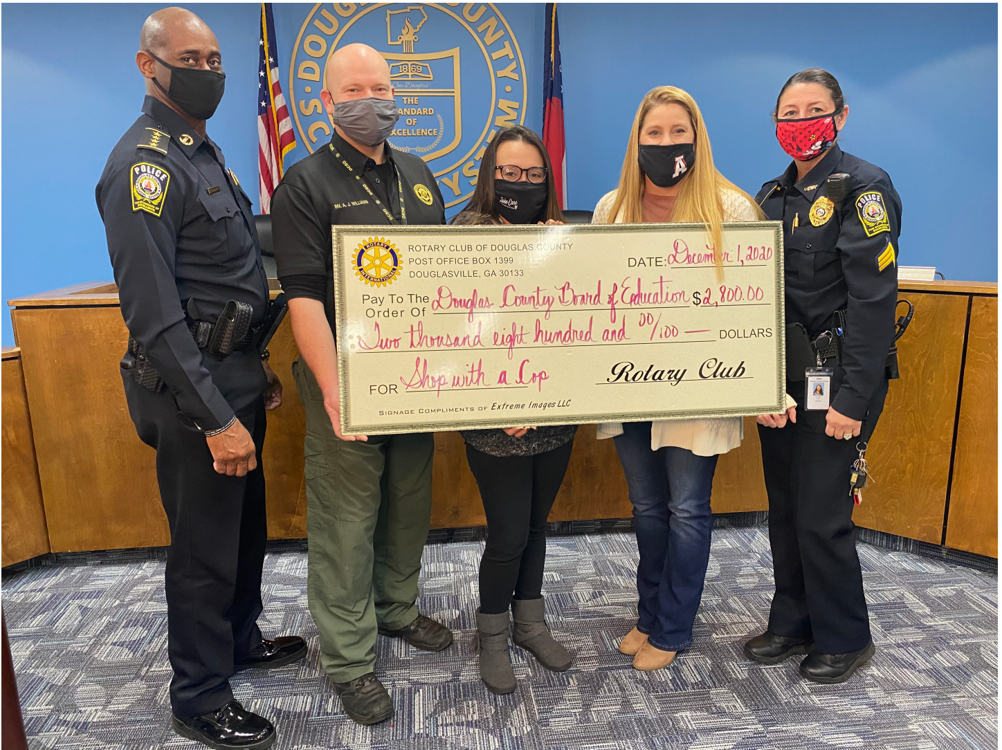
The Rotary Club of Douglas County donated $2,800 to the first annual Shop with a Cop hosted by the Douglas County School System Police Department. The money will sponsor 56 children for the holidays. We look forward to joining the children, police officers and others in the community later this month to help the children shop for Christmas.