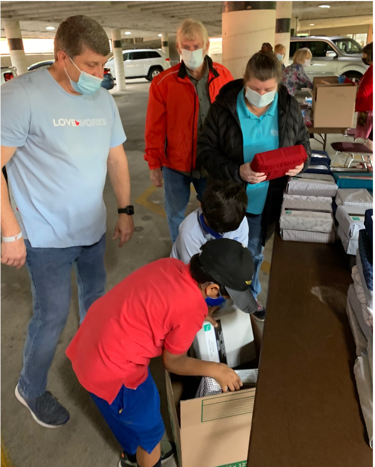
In September, Rotarians from Columbus, North Columbus, Muscogee and Rotaract Clubs met enthusiastically and safely at the Trade Center Parking garage, to carry out our collaborative club service