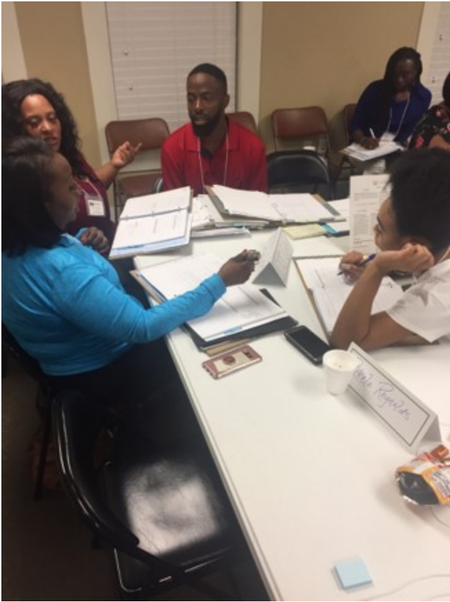
Posted by Carol Jones December 3, 2020