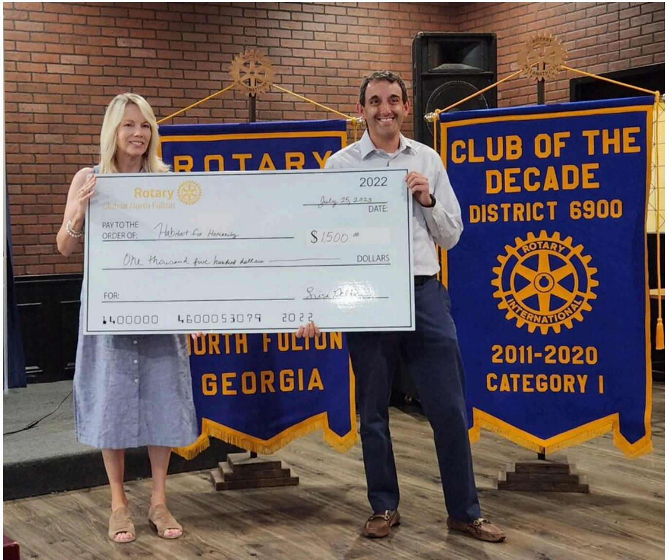
Posted by Lisa Gelber October 1, 2023