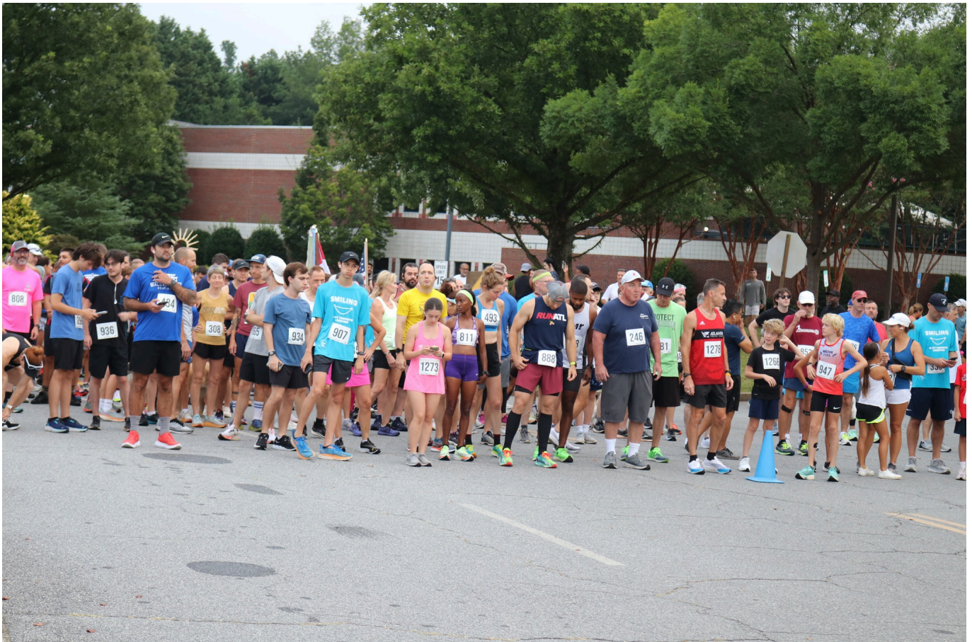
Posted by Jonathan Rudolph September 27, 2023