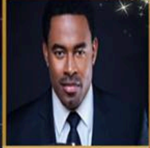
Actor Lamman Rucker