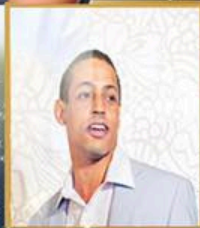
Tampa Bay Bucs Brent Grimes