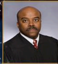
Dekalb Co. Judge Gregory A. Adams