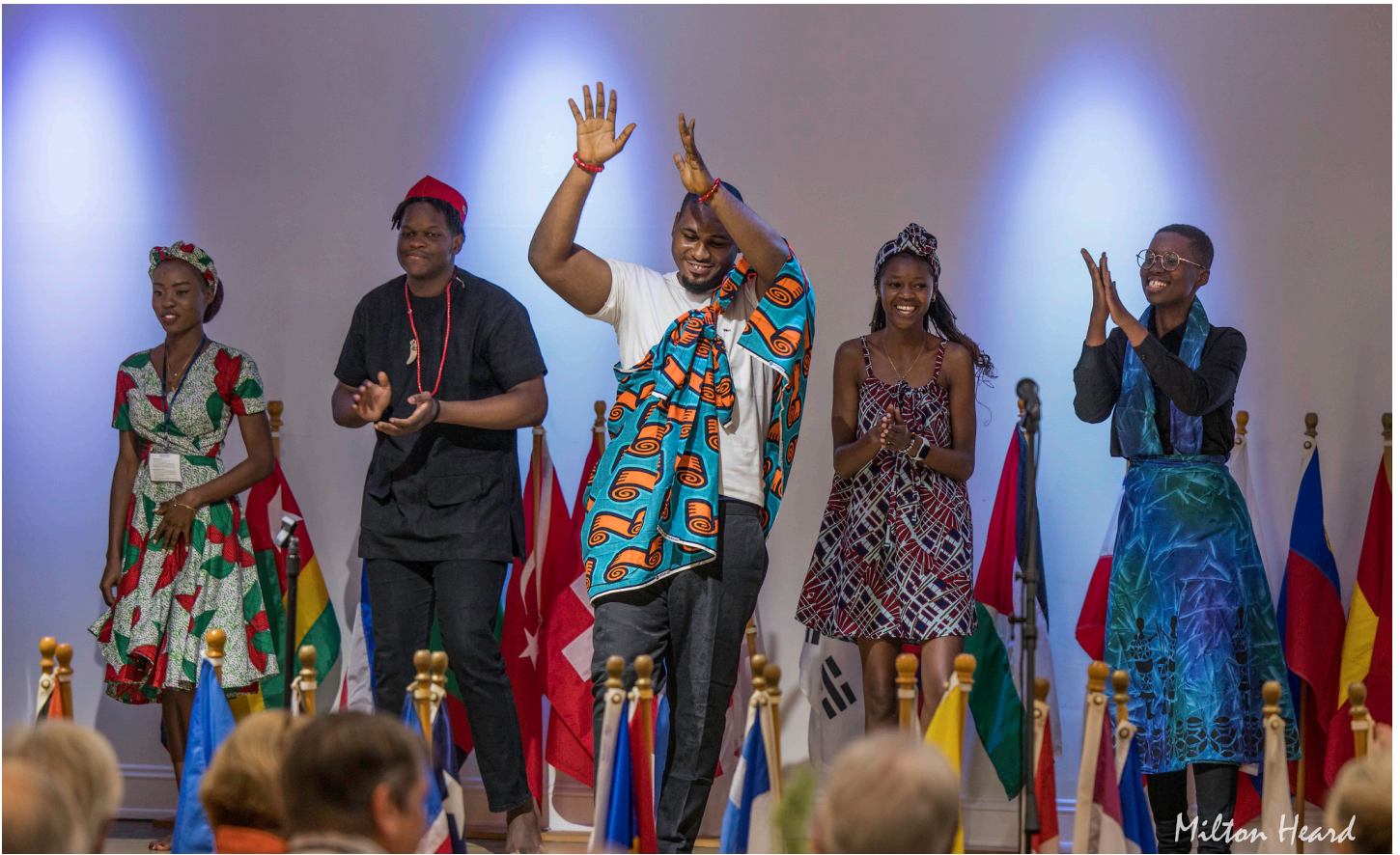
Posted by Kathyeryne Fields August 31, 2023