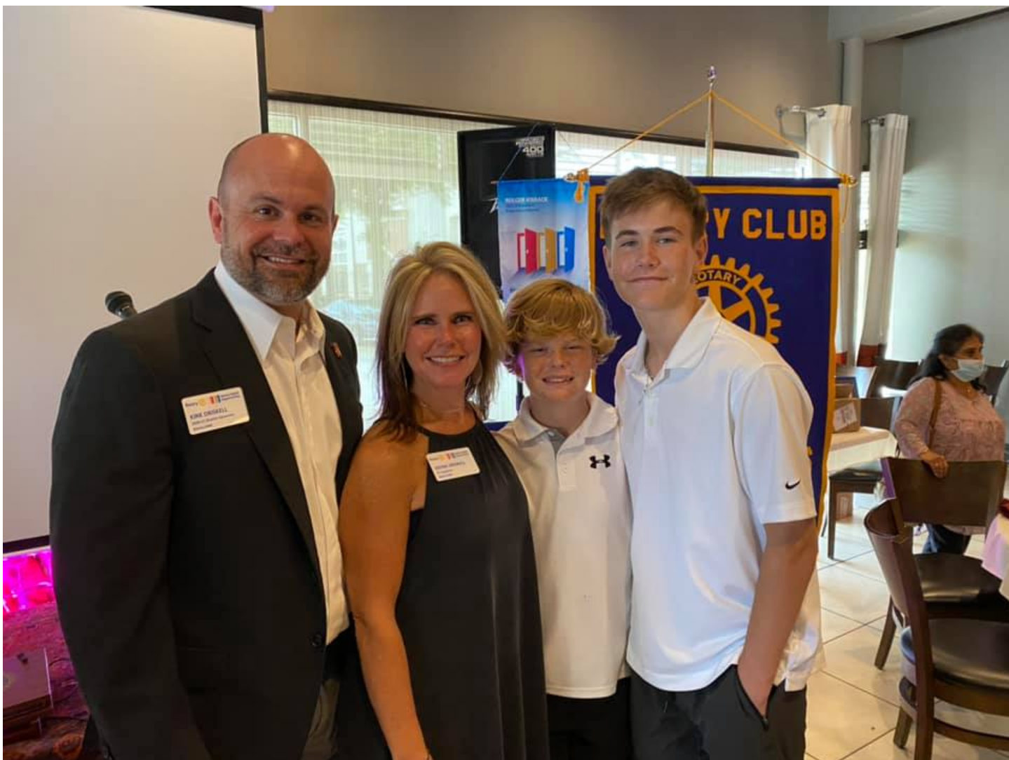
Posted by Kirk Driskell July 6, 2020